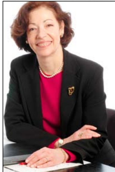
The Budget, Advanced Security, and Executive View License modules give you the data you need to make informed decisions.

A wide variety of methods for entering budgets make this sometimes burdensome task quick and easy. The Budget Worksheet features a famil-